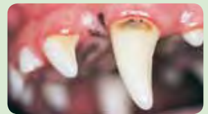
(2) Gingivitis – with early calculus