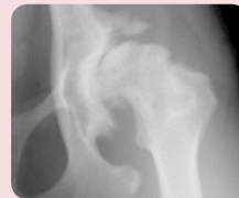
X-ray of an arthritic hip joint in a dog. The symptoms of arthritis are often much worse in overweight pets.