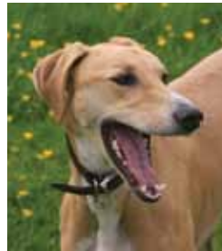
The progression of gum disease in pets

Unfortunately once a tooth becomes loose, the problem is usually too advanced to save that tooth. However if gum problems are identified at an earlier stage, a combination of a Scale and Polish and ongoing Home Care can make a real difference to your pet's oral health (and also their breath!). Please contact us today for a dental check-up!